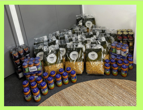
Just some of the haul we received!

Well-done to RCW and 6LP who will be spending next week with Biscuit Bear!